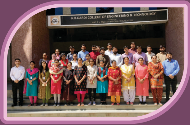
Active Faculty Participation at a Glance